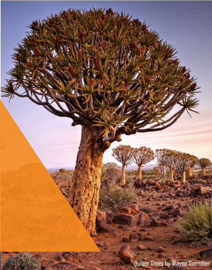
Quiver Trees