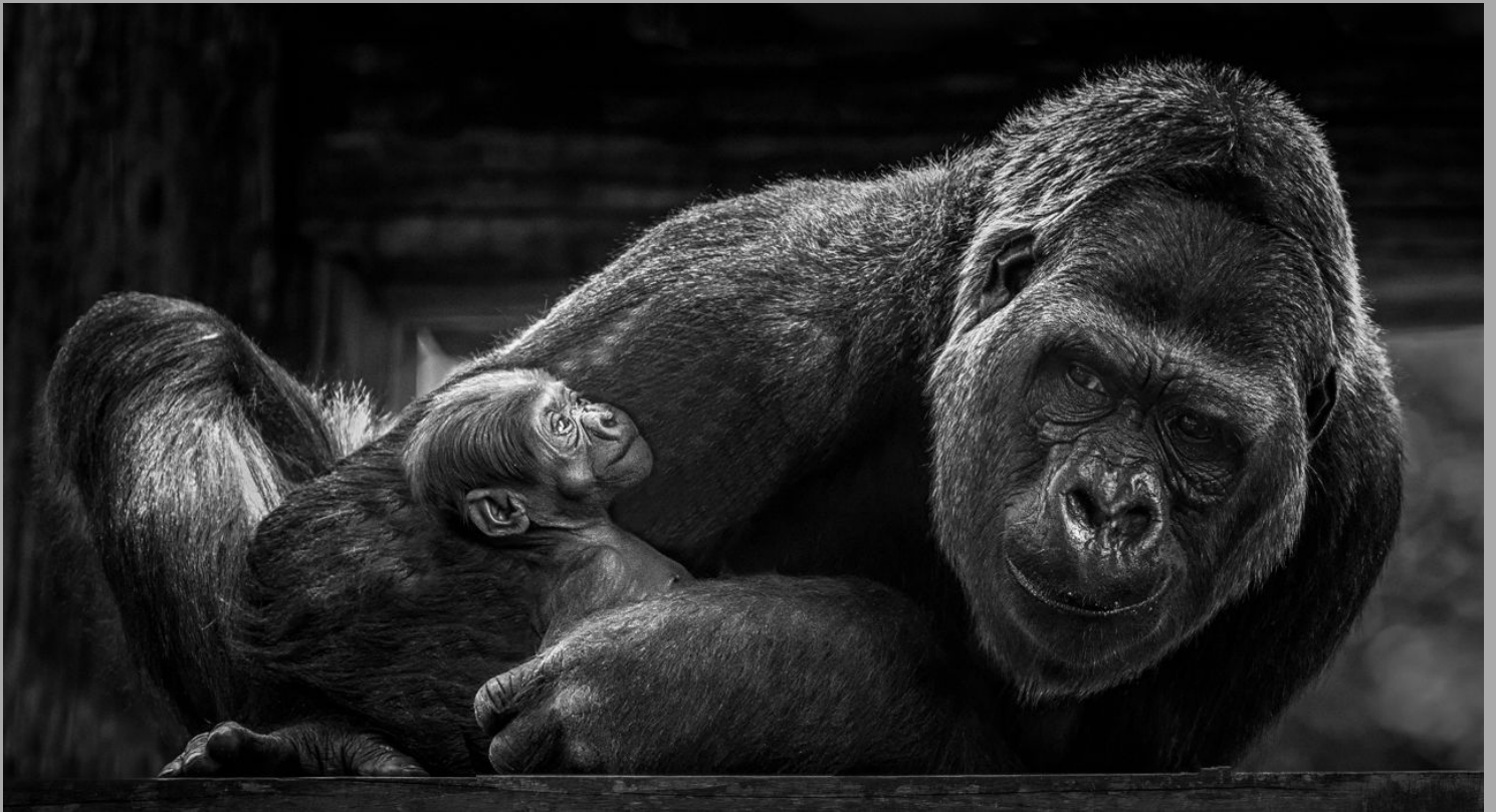
“My Baby” By Goutam Sen