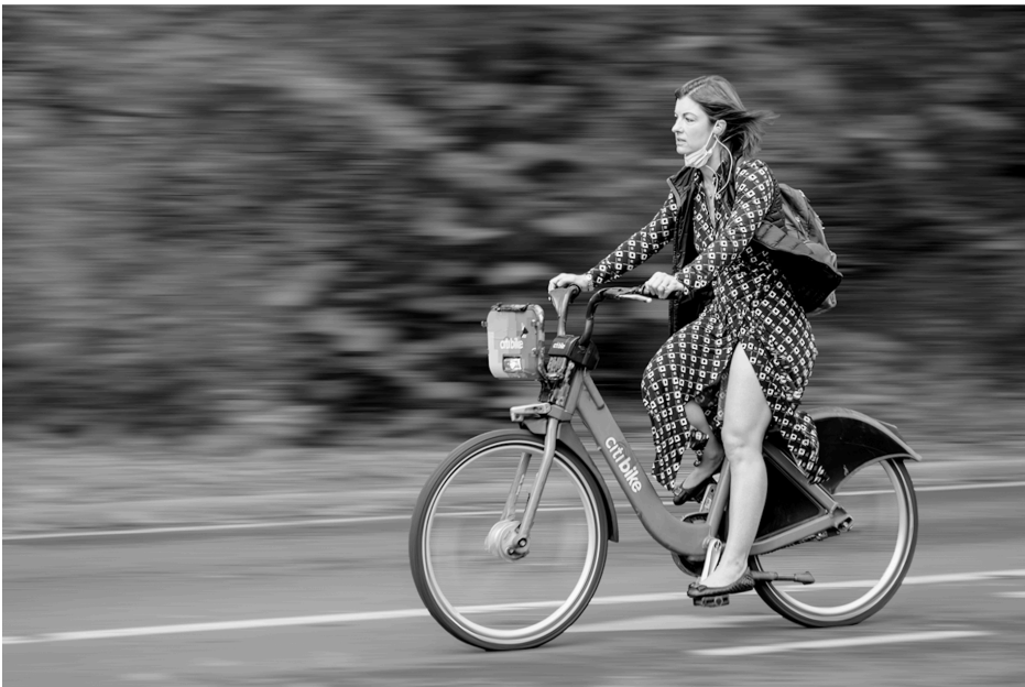
Thirid Place Monochrome “Daily Commuter” By Goutam Sen