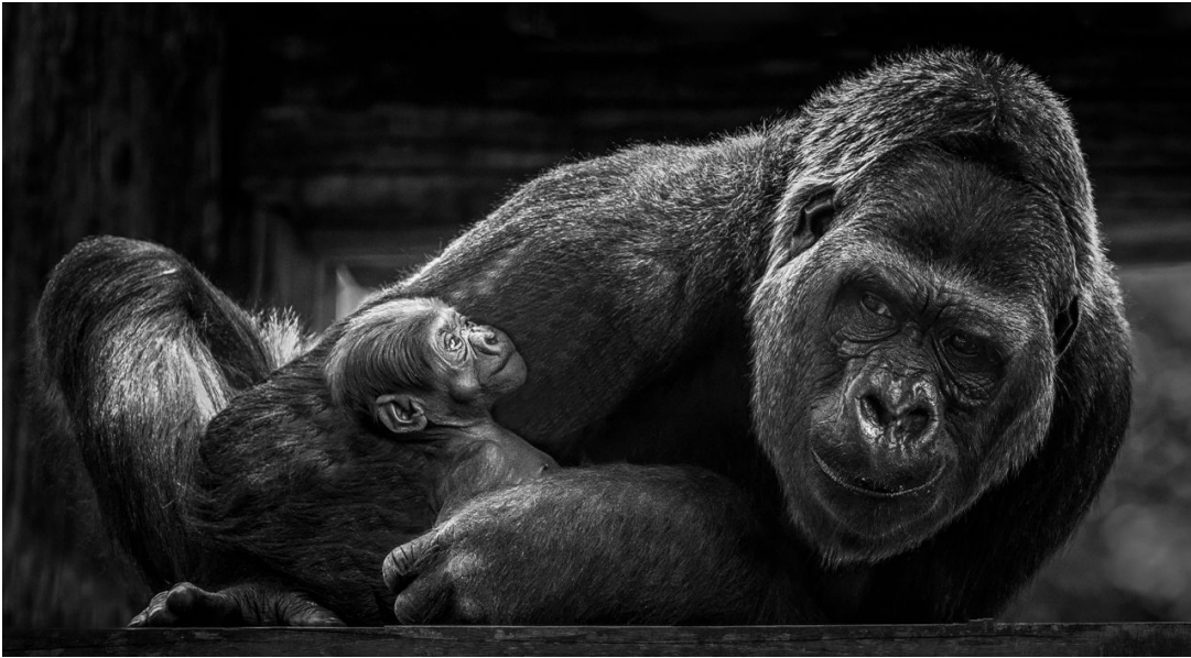
First Place Monochrome “My Baby” By Goutam Sen