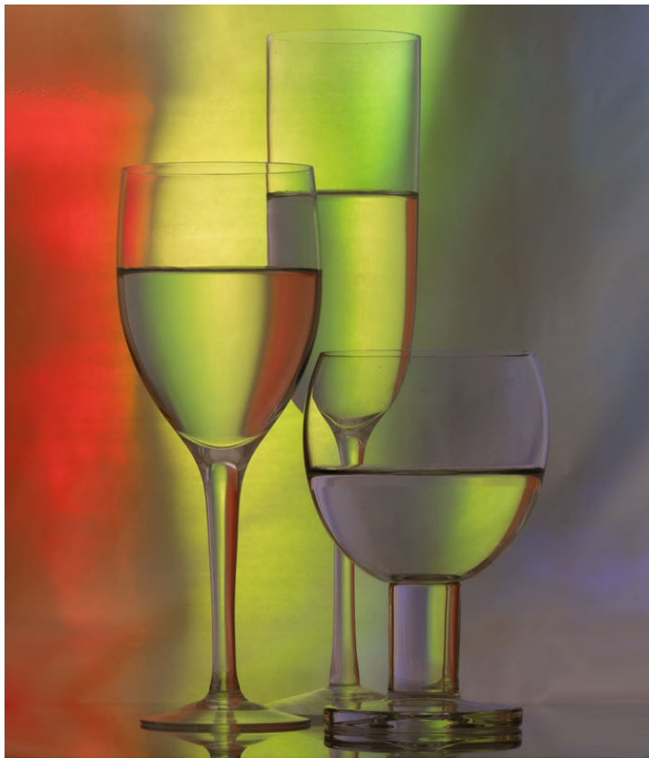
First Place Color “White, Red, and Prosecco” By Gosia Klosek